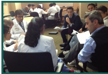
IM Residents working in their small group sessions.

dents from colleagues, faculty mentors, the OSCE faculty champion and program director. The focus of the workshop was to generate conversation that increased the residents understanding of a successful patient encounter. The feedback from colleagues and faculty was given in the context of the Kalamazoo Essential Elements Checklist. A post workshop survey was administered which reflected a posi-