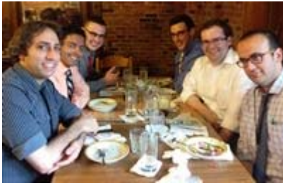
Residents enjoy their welcome dinner at Traffic Jam & Snug, Detroit 6/24/14