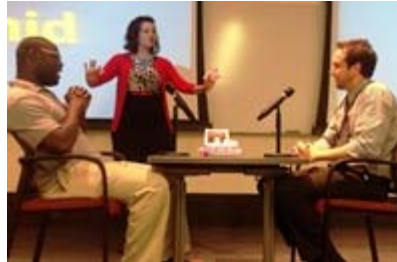
At residency orientation: "Competency Pyramid," modeled after the game show, one resident tries to identify core competencies used to measure resident training.