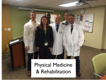
Physical Medicine & Rehabilitation